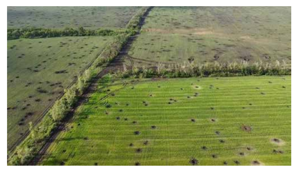
Fig. 1. Satellite image of the agricultural territory of the Izyum district. Photo from the website of the Ukrainian Nature Protection Group [12]

waste, residues of explosives, decontamination substances, heavy metals and their compounds, radioactive substances. Chemical micro-components of pollution are mainly represented by heavy metals, such as cadmium, lead, zinc, copper. These elements are indicators for changes in the ecological state of territories with contaminated soils and territories adjacent to them [14].